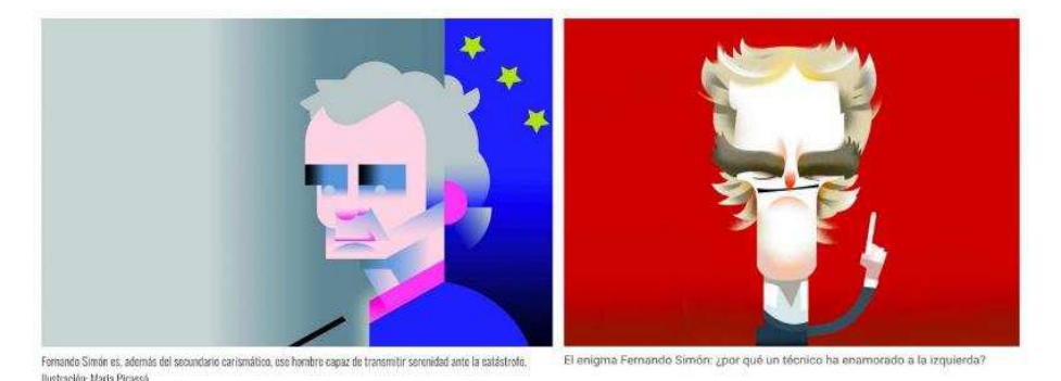
Image 2 : Illustrations of Fernando Simón published in El País (https://links.uv.es/AMd38G1) and in El Confidencial (https://links.uv.es/1VPK1fh).