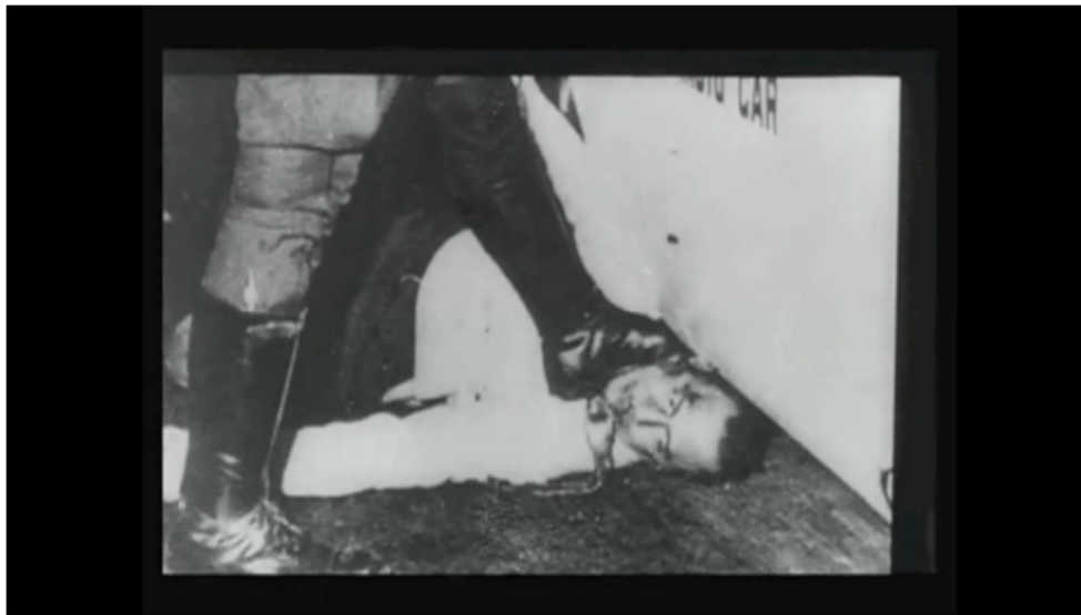
Figure 1: Now (Santiago Álvarez, 1965).

the state in the public sphere. In the chosen examples, police officers assault immigrant citizens, working class citizens, and women. While it is true that these images of repression of vulnerable groups in the context of the coronavirus crisis are recurrent, this is not a novelty since they appear in countless visual records. For example, in documentaries on the struggles for civil rights, such as African American movements during the decade of the 60s in the USA. In Now (1965) by Cuban filmmaker Santiago Álvarez –who lived those years of his youth in New York and, therefore, he closely experienced those struggles– a whole catalog of archive images is shown, which points to the political-thematic dimension of this visual motif. In Álvarez's film, as in the images that we are going to analyze below, archive images are used to show several police officers throwing and attacking black people: sometimes grabbing their heads from behind, other times beating in their faces or stepping on their necks (Fig. 1). This last image is the one that is closest to our example and the one that is most sadly reminiscent of the reckless homicide of George Floyd.