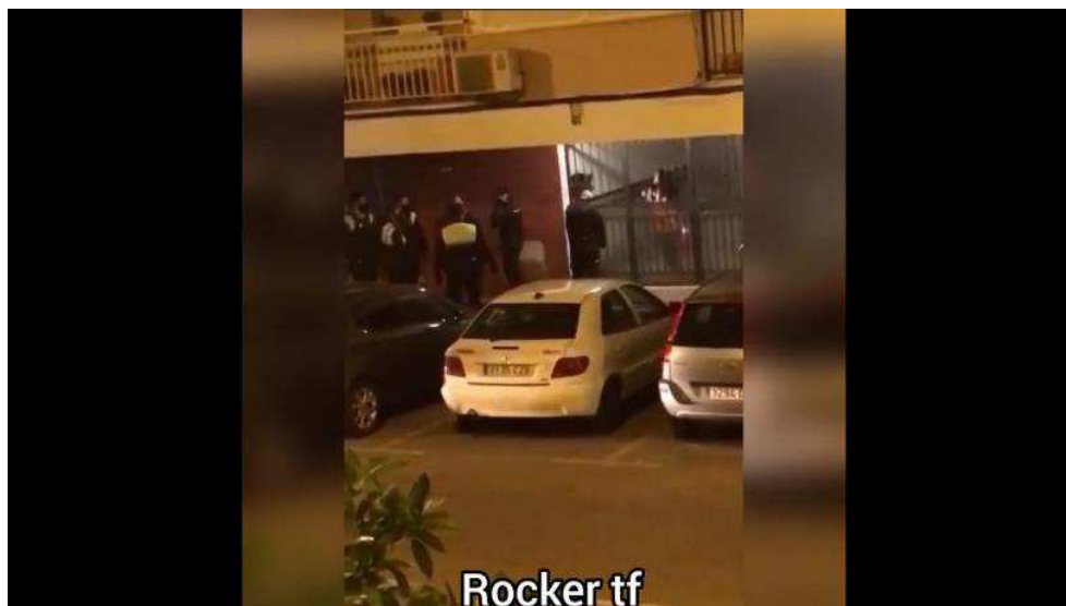
Figure 6: The lynching-gaze over an immigrant.

Another characteristic of the lynch-gaze is that, often and not coincidentally, the people “lynched” belong to vulnerable groups –a fact denounced by organizations such as SOS Racismo or Amnesty International– where hatred is rooted in prejudice and racial, class, and gender discrimination. This is observed in the following example (Fig. 6) of a conflict between the neighbors who watch from their balconies and a passer-by before the police arrive. It is based on the confrontation among the “Spaniards” who reprimand her for the threat that she represents as an Ecuadorian immigrant, betraying the conception of “a dangerous world” that promotes “the presumption of guilt” of otherness, the basis of the security logic of the “State of surveillance” (Foessel, 2011, p. 59). The woman is rebuked by the shouts and insults of “bitch” or “slut” and is incited by the agents to enter her house. The narrator of the video, the subject of the lynch-gaze, makes a comment that highlights the thought of a patriarchal vigilante: “we would have already slapped our women twice.”