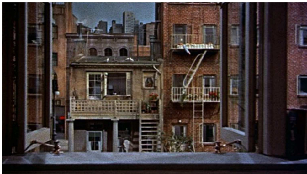
Figure 2: Rear Window (Alfred Hitchcock, 1954).

In Hitchcock's film, the act of looking takes center stage thanks to those swings of the image that describe the emotionality of the subject of enunciation and construct a look inside the film universe.