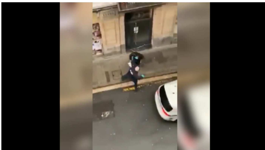
Figure 4: The protest-gaze.