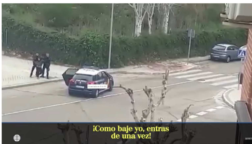
Figure 5: The lynching-gaze.