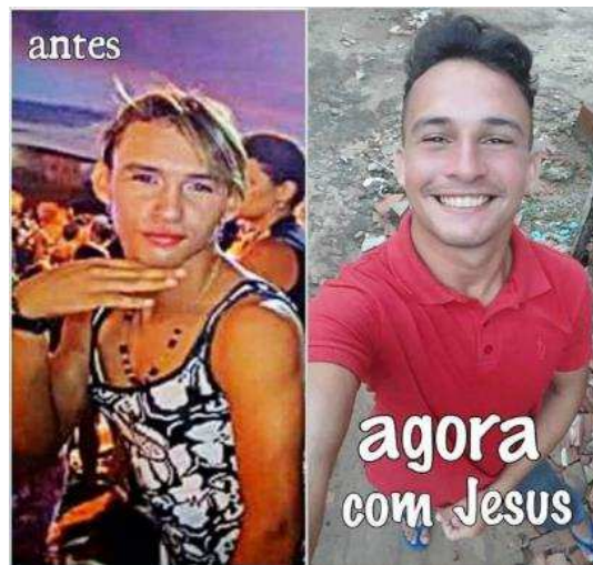
Figure 3: “Before and after.”

Another moral dichotomy has also been constructed in this image: on the left we see a person with women’s clothes, and the word “before.” On the right is the same person, dressed differently. The writing on this image reads: “Now with Jesus.” The image tries to criminalise the LGBTQ+ collectives by saying that they have no morals or ethics. The story constructed was that to transform yourself into a good citizen you have to believe in Jesus. Jesus will be the solution to end with “the disease of transsexuality.”