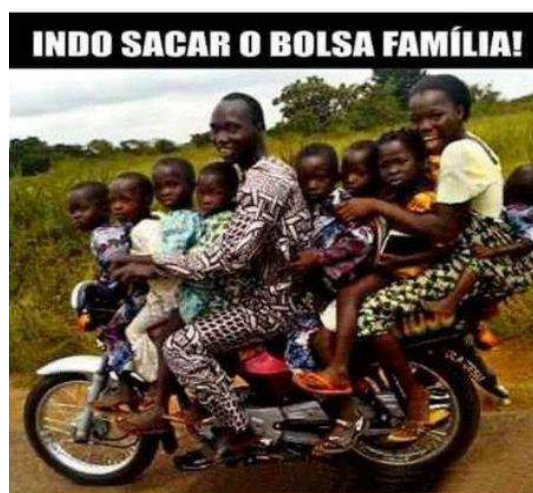
Figure 6: “Bolsa familia” motorbike.

This image shows a group of black people, possibly a family, on a motorbike. The written message says: “going to get the Bolsa Familia.” Although the original image does not necessarily correspond to Brazilian people, the added text refers to a social project called “Bolsa Familia,” a kind of basic income targeted at vulnerable groups. The image suggests irresponsibility and lack of control, which are the stereotypical negative features of the black population.