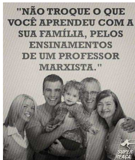
Figure 9: Marxist teacher.

This image shows a traditional happy family. The message reads: "Don't change what you have learned from your family for what a Marxist teacher will teach you."