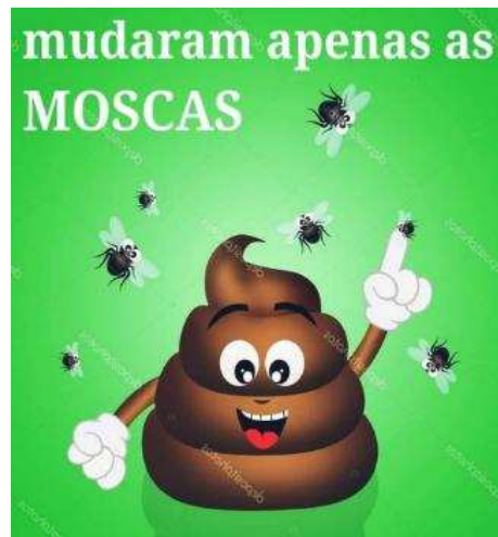
Figure 12: Flies and excrement.

This image shows a piece of excrement surrounded by flies. The message reads: “only the flies have changed.” It is the anti-establishment discourse of Bolsonarism. All politicians are like flies that fly around the excrement, but the system itself, in other words, democracy as it exists, is the core structural problem. Voting for other politicians is no use, as the system has to be changed; and to change the system the only option is to vote for Bolsonaro and his markedly military discourse.