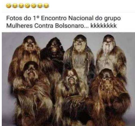
Figure 5: Chewakas.

This image shows a number of Chewakas (characters from the Star Wars saga). The title reads “the first national meeting of women against Bolsonaro.”