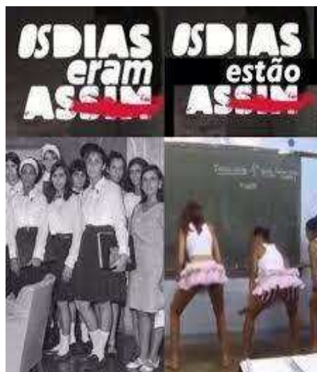
Figure 11: “Moral depravity” in schools.

This image consists of two photographs of classrooms side-by-side. On the left the text reads: “Days were like this,” showing serious young female students wearing uniforms. The image on the right has the legend “Days are like this.” It shows some female students dancing provocatively in the classroom.