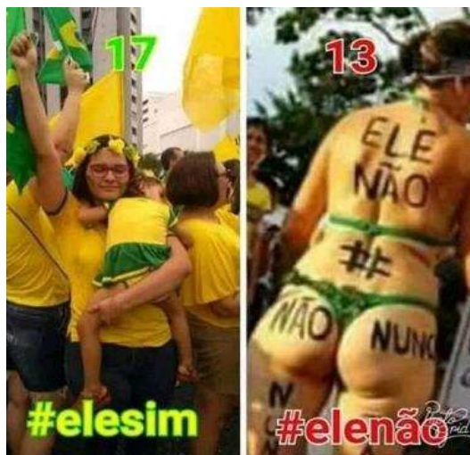
Figure 2: “Ele Sim vs ele não.”

During the election campaign the hashtag “ elenão ” (“not him”) was created to reject the candidature of Bolsonaro. Because of the success of the hashtag, the Bolsonaro supporters decided to create the opposite hashtag, “ ele sim ” (“yes, him”). The image shows on one side the attributes of women who support Bolsonaro. They are morally ethical, take care of their children, respect the family and practice good hygiene and their public image.