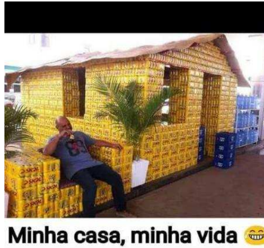
Figure 7: “Minha casa, minha vida.”

This image is another criticism of vulnerable groups. It shows a man sitting down drinking beer. Next to him is a house constructed out of beer cans. The text reads “Minha casa, minha vida” (my house, my life). This refers to another social welfare project, which makes public housing available to people who need it most and who live in favelas . Nevertheless, Bolsonarism criminalises these groups, trying to represent them as alcoholics, who use the housing system to buy drink.