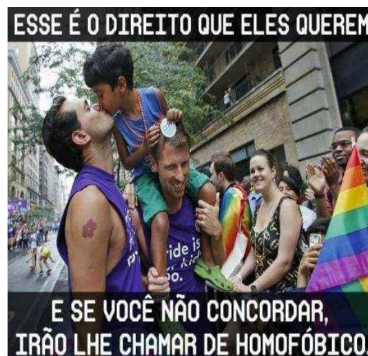
Figure 4: “They’ll call you homophobic.”

This image portrays a man kissing a child, next to gay pride flags. Under the image is the phrase “This is the right of those who love. And if you don’t agree, they’ll call you homophobic.” The message aims to normalise the idea that the LGBTQ community want to sexually “pervert” children. The family must be protected, as these people could endanger the supposed moral cleanliness of children.