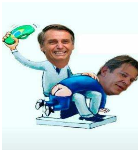
Figure 14: Bolsonaro flogging Haddad.

This image shows Bolsonaro spanking the opposition candidate Fernando Haddad with a flip-flop. The flip-flop is covered with the Brazilian flag. The degradation of the spanked man is clear, becoming a child in an obscene image. The image transmits the violence that must be exercised against political opponents: the opposition and its ideas must not be respected; they have to be spanked in the name of something greater: in the name of Brazil. The use of the Brazilian flag on the flip-flop shows how the nationalist project justifies the use of violence. If it is a case of saving Brazil from its enemies, any technique is possible.