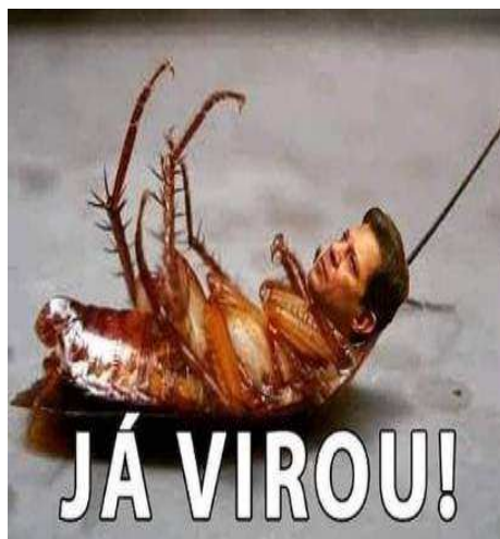
Figure 13: “Haddad cockroach.”

This image is of the candidate of the Workers’ Party (PT) Fernando Haddad, represented in the body of a cockroach. Part of the scatological language of Bolsonarism aims to trivialise violence, dehumanise the enemy and present him as something dirty.