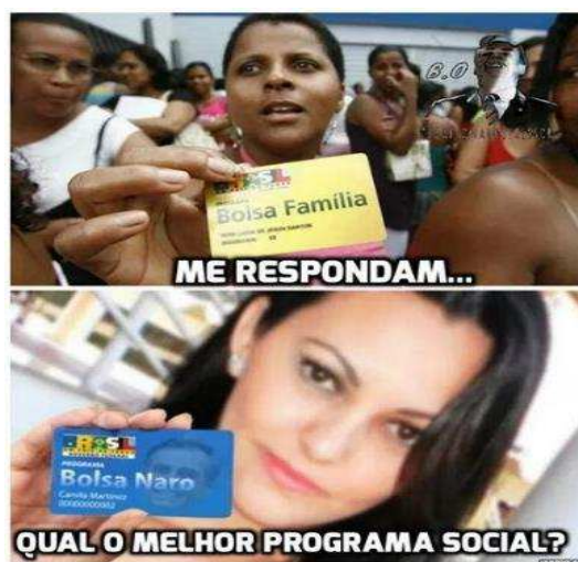
Figure 8: Women with “BolsaFamilia” cards (social assistance).

In this image, the text reads: “What is the best social programme?” In the upper part an Afro-Brazilian woman is showing her “Bolsa Familia” card. At the bottom, a young, slim, white woman shows a card on which is written “Bolsa Naro.”