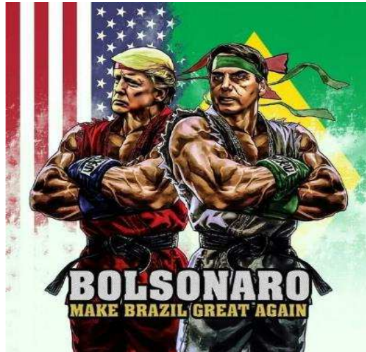
Figure 1: Bolsonaro and Trump.

To construct the enemy, the opposite side is needed: the hero. This image represents Donald Trump and Jair Bolsonaro as muscular heroes prepared to save their countries. Trump and Bolsonaro are compared to the figure of Rambo, and the message transmitted is that only through force and violence will it be possible to overcome the enemy. The message strengthens the dichotomy between good and evil, between the good citizen with respect to the bandit; of the hero against the enemy. In other images the hero is associated with religion through allusions to Jesus, angels or overcoming sin.