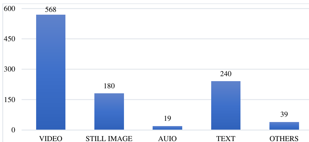
Graphic 3: Textual typologies of the transmedia universe of The Ministry of Time .