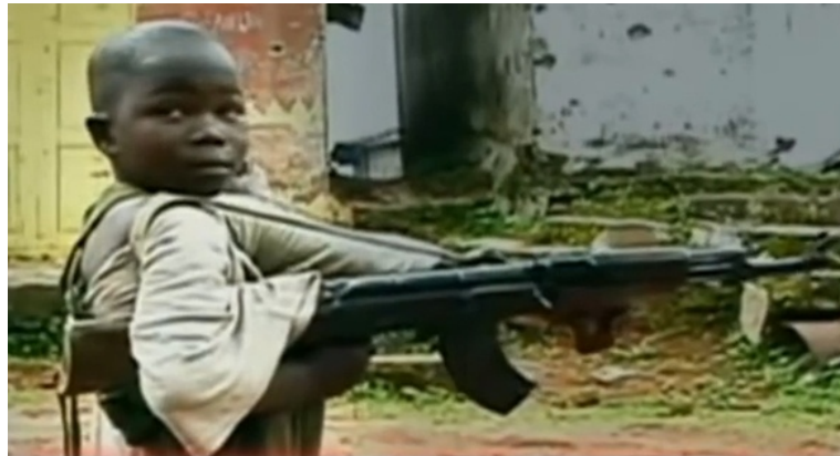
Figure 2. YouTube. If you come into the Manguinho neighborhood, we're going to kill police (video) 5 .

The apology for crime is outlined as a discursive field through which narratives of programmatic violence circulate, and presents a simplified version of the social conflicts that cross the world of crime, based on inside-out, brother-enemy pairs, world of crime-society prestructured command. The meaningful games put forth in the apology for crime are as alternative livelihoods for those who adhere to the commands, obtaining physical protection and psychological empowerment, social affiliation, justifications that promise to legitimize involvement in illegal and violent activities, a culprit for the pain, an enemy against whom to fight: "We are not 'illegal' because we are the ones who make the Law. (YouTube, Faixa de Gaza, video)" 6 .