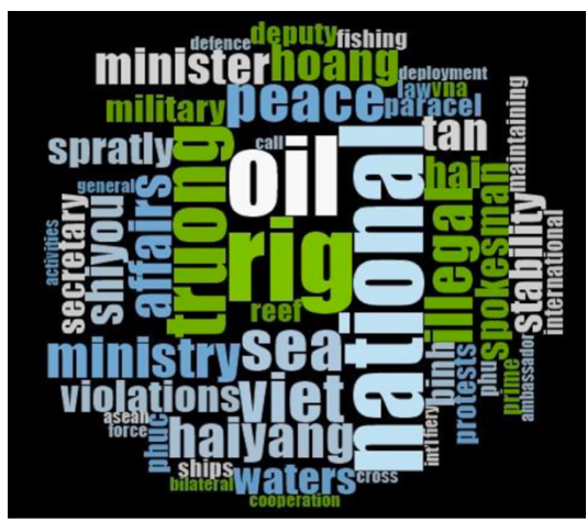
Figure 1. Illustration of Truong Sa name.

In Figure 1, the Saigon Times Daily exhibits greater concerns about Truong Sa in the SCS disputed areas. Located in the East Sea, the Truong Sa archipelago is large (about 38% of the total of the East Sea) and overlaps with areas claimed by other disputants. In Table 4, preferred geographic terms (East Sea, Truong Sa, and Hoang Sa) are also recorded through the keywords in the first, second, and fourth topics: Peace and Stability (K1), Haiyang Shiyou Oil Rig (K2), and Sovereignty over Hoang Sa and Truong Sa (K4).