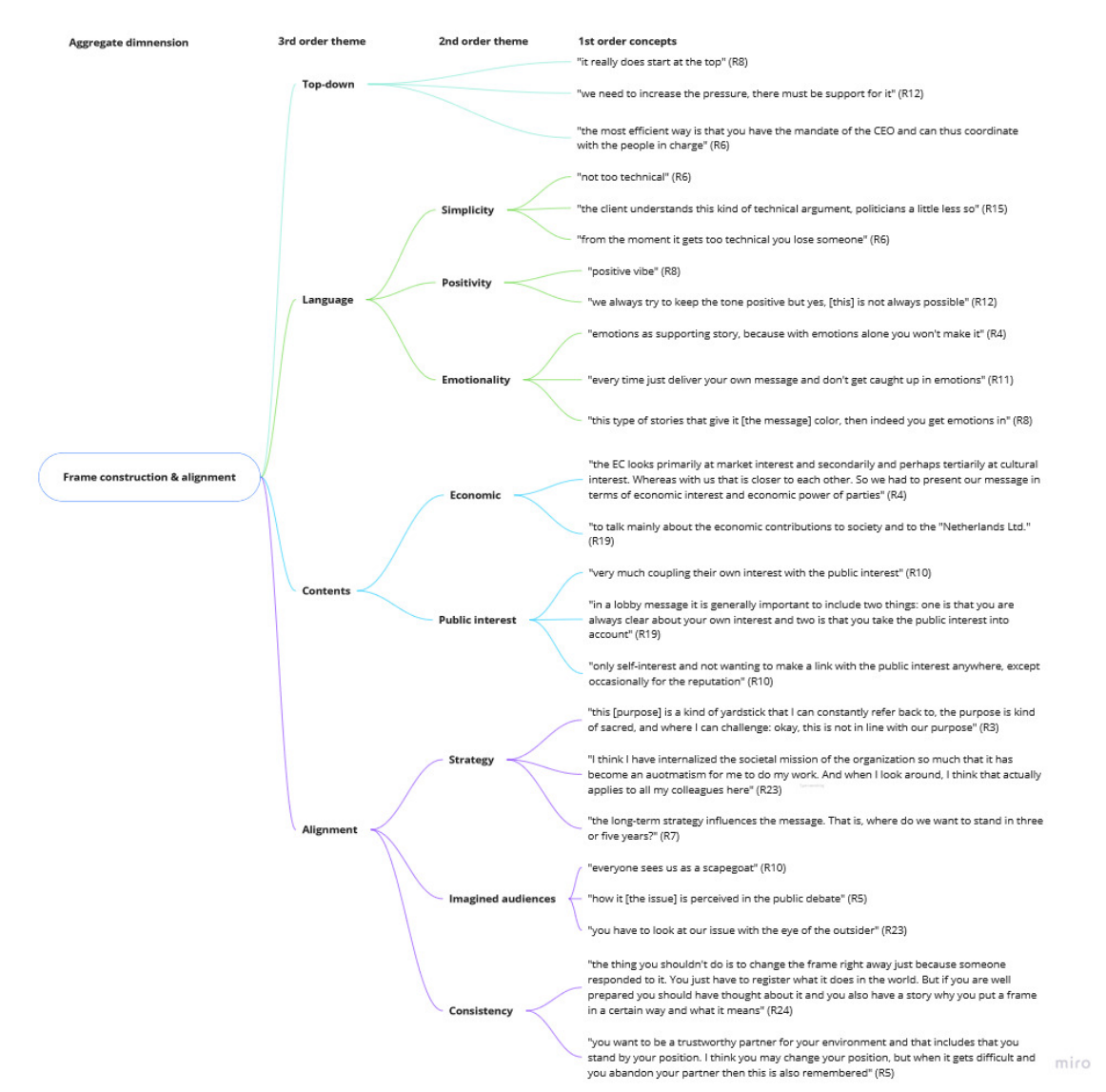
Figure 1. Example of the relations between lower-order concepts and an aggregate dimension.