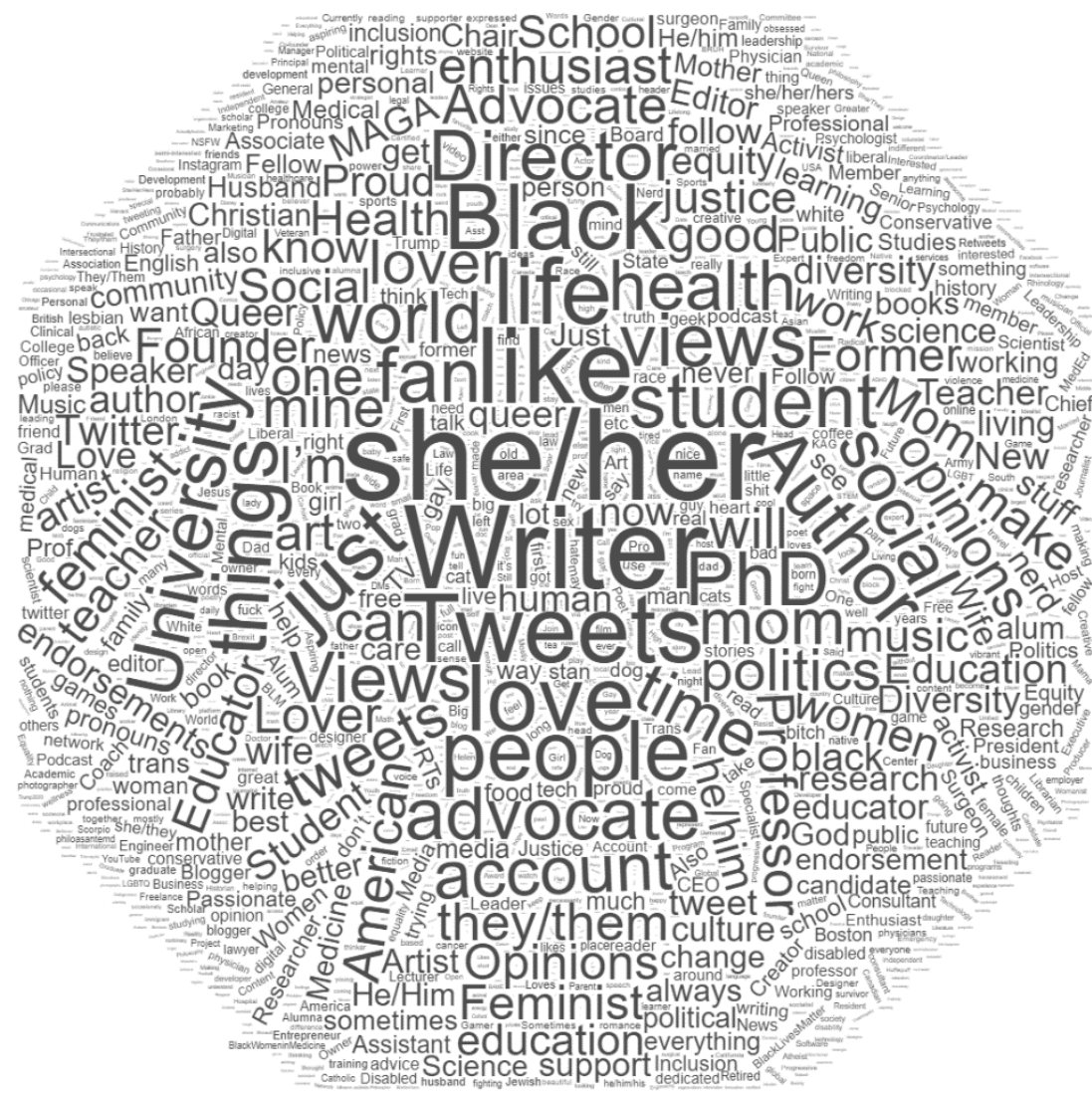
Figure 1. Word cloud overview of profile descriptions.