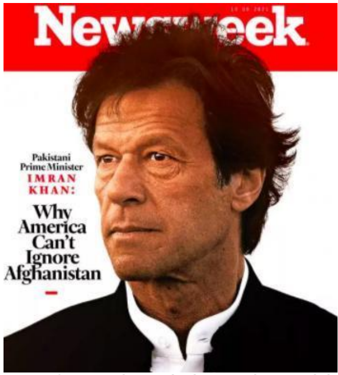
Figure 2. Cover page of Newsweek Magazine in September 2021 (O'Connor, 2021).

However, the way the public reacts to those frames generates feedback from lower to higher levels, and this may sometimes lead to a frame adjustment (Entman, 2004). Zaller's model has been observed to have some boundary conditions that need to be considered, such as the increased relevance of any issue in citizens' daily lives, or meaningful exposure to relevant information via the news media that may enable citizens to reasonably determine their own position independently of political elites (Zaller, 1992, as cited in Bullock, 2011). Bahador (2011), however, showed that U.S. media was less likely to cover an issue that did not directly involve Westerners or their military forces, which may translate into less coverage of a post-U.S. withdrawal from Afghanistan. Thus, the power of elite messaging would be even more potent then. With that said, however, the foreign publics may still not have a better view of a country even if they had more or better information (Entman, 2008). Entman (2008) gave an example of the image of America abroad: