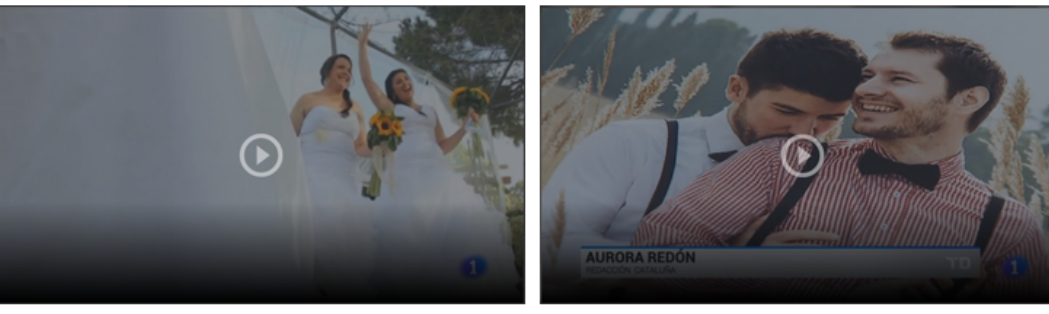
Figure 2. A lesbian marriage (TVE, 2015b, 0:00:00) and a gay marriage (TVE, 2017, 0:00:00) opened two news items broadcast by TVE.

It is worth mentioning that of the 12 couples coded as same-sex relationships, only two were clearly perceived explicitly and unambiguously as such (see Figure 2). These two couples, one formed by two women and another by two men, appeared, respectively, in the items entitled "Wedding Videos Renewed With the Latest Technological Advances" (TVE, 2015b) and "The Best Wedding Photographers Meet in Barcelona" (TVE, 2017).