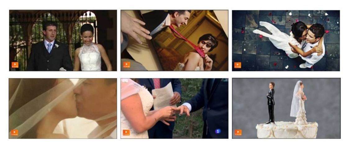
Figure 1. Opening shots of news items about marriage broadcast by TVE. From left to right and top to bottom: (1) "Pre-Nuptial Agreements" (TVE, 2011a, 0:00:00); (2) "Wedding Photography in Madrid" (TVE, 2012a, 0:00:00); (3) "Wedding Videos Renewed With the Latest Technological Advances" (TVE, 2015b, 0:00:00); (4) "Demands for Divorce and Separation Decreased by 2.6% in 2015" (TVE, 2016, 0:00:00); (5) "Spain is the Second EU Country With the Highest Divorce Rate" (TVE, 2018, 0:00:00); (6) "Divorce Inquiries Rise in Spain After Lockdown" (TVE, 2020, 0:00:00).

The analysis of the 44 audiovisual pieces making up our sample revealed that most news stories offered a representation of marriage limited to couples formed by one man and one woman. Indeed, 77.3% of the examined items only represented straight couples. As Figure 1 shows, many shots offer the audience a representation of marriage as a couple formed by one man and one woman. In only 10 of the studied news items could references to same-sex couples be identified. Eight of these 10 pieces visually depicted same-sex couples, while the other two represented them by spoken discourse. This means that same-sex marriage appeared in only one in every five news pieces on marriage when addressed from a generic point of view.