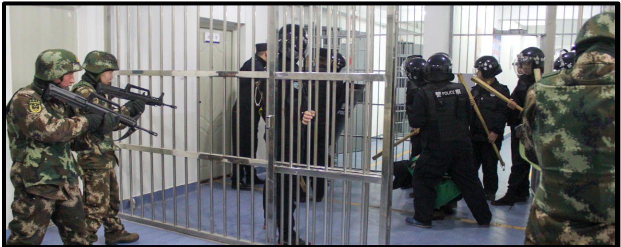
Figure 2. One of the thousands of photographs depicting brutality in the XUAR camps, in this case in a facility in Tekes county, Ili Prefecture, as leaked by Adrian Zenz (2022).

In contrast to Ghopur's smiling image, a trove of photographs released by Adrian Zenz (2022), what he calls "The Xinjiang Police Files," depict the camps as factories of misery (see also Alecci, 2022). The leaked evidence, supplied to Zenz by a hacker who accessed Chinese security networks, includes more than 5,000 "mug shots" taken of Uighurs on their arrest by the CPC and evidence of interrogation techniques, isolation strategies, reeducation in action, and security teams training for possible riots or escape attempts (see Figure 2). Whereas Figure 1 humanizes a victim by depicting his happy, pre-arrest self, Figure 2 depicts the military machinery of repression. Here is the infrastructure of the "Strike Hard" campaign, complete with prison SWAT teams, battle-level hardware, and a prisoner encased in a Guantánamo-style black hood. This image also works as an "affect generator," albeit in a different way, for whereas Figure 1 enables identification with a Uighur, Figure 2 prompts revulsion at the agents of his and his community's pain. The XVD archive enables viewers to exercise empathy with individuals, while the "Police Files" trigger anger at the architects of genocide. These images indicate just some of the visual strategies activists employ to bear witness to atrocity (for more examples, see Hingst, 2022; Romney, 2022).