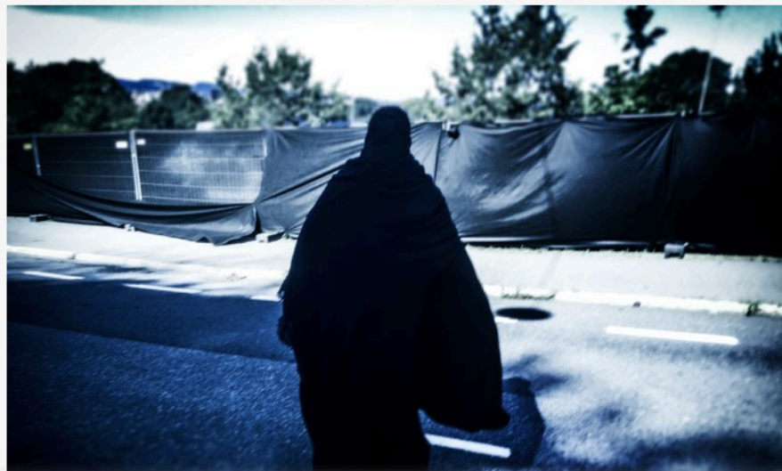
Figure 3. Screenshot from the photo series (Storhaug, 2018). Image caption: "Below you will find a photo series from Oslo, taken by HRS, this summer. Yes, it is Oslo, not Mogadishu, Kharian in Pakistan, or a big city in the Middle East."