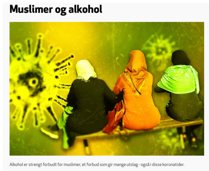
Figure 1. Screenshot from HRS (Karlsen, 2020a). Translation of image caption: "Alcohol is strictly prohibited for Muslims, a prohibition that leads to many outcomes—also in these Corona-times." 1

While my primary goal with this article is conceptual, I will illustrate my overarching theoretical points with empirical examples from the Norwegian right-wing alternative media platform Human Rights Service (HRS). HRS is an excellent example of a social platform that performs affect and intensifies negative emotions in ways that direct social media users away from Muslims. Despite having been the center of many controversies, HRS has gained an influential agenda-setting role and has received significant state funding for many years. More importantly, HRS runs a calculated fine balance between its scandalous, affective, fictionalized, and antagonistic content and its self-identification as neither Islamophobic nor racist. Here is a brief example of the type of speculative content that is run on HRS.