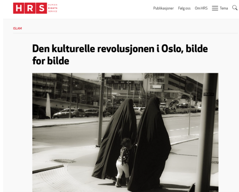
Figure 2. Screenshot from HRS (Storhaug, 2018).

In 2017, HRS called on its followers to take photos of Muslims in public spaces in Oslo to "document" what they deemed a "cultural revolution." HRS ran the controversial photo series in 2018 under the heading "The Cultural Revolution in Oslo, Picture by Picture" (Storhaug, 2018; see Figures 2 and 3).