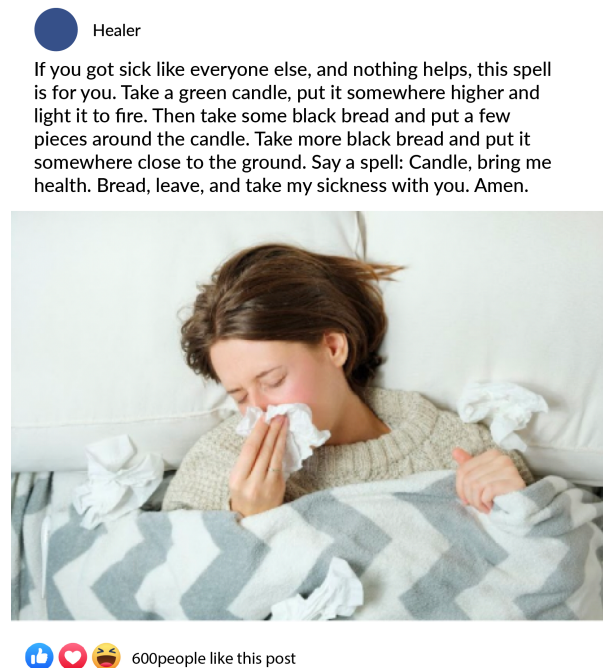
Figure 2. The healer creates regular content that would relate to the followers' daily worries during COVID-19. This content would possibly lead to private consultation and service requests (ethical fabrications of Facebook posts with open-source photo by photoboyko, n.d.).

The healers feel that the platform entices them to build relationships around trending topics and dialogue on relevant and topical issues when they arise. During the data collection period, the most prevalent and controversial topic was COVID-19 and its related aspects, such as masks, vaccinations, restrictions, and medicine. The interviewed healers held diverse health-related beliefs, with some advocating for biomedicine, while others leaned toward herbal medicine. Similarly, the healers' beliefs ranged from strong support for medicine to complete denial of the existence of any ongoing pandemic. Regardless of their attitude, these beliefs were transformed into spiritual goods, services, and discursive self-brands—ranging from selling magic potions to advising on pharmaceuticals. However, the healers frequently face the challenge of context collapse (Marwick & boyd, 2010), as they have to cater to diverse audiences consisting of thousands, if not tens of thousands, of individuals with varying beliefs and who express themselves vociferously. As such, speaking up on trending topics contributes to the emergence of polarizing debates among both, the healers and their followers.