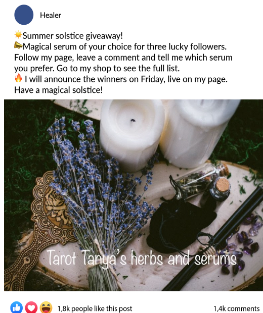
Figure 4. A healer is promoting her products online through gamified activities. Copying from other sharing games, she produces a product-related lottery as it grabs attention from both users and algorithms (ethical fabrications of Facebook posts with open-source photos from Canva, n.d.).

Healers sell and promote their commodities by making them visible using social media marketing techniques. One of those ways is by sharing consumer games, as is seen in Figure 4. Similarly to social media influencers, some healers tackle the creation of social media content with a deliberate plan, clear objectives, and the ambition to achieve professional success (e.g., approach their page with a marketing plan, having at least one post per day, and creating viral giveaways; e.g., Duffy, 2017).