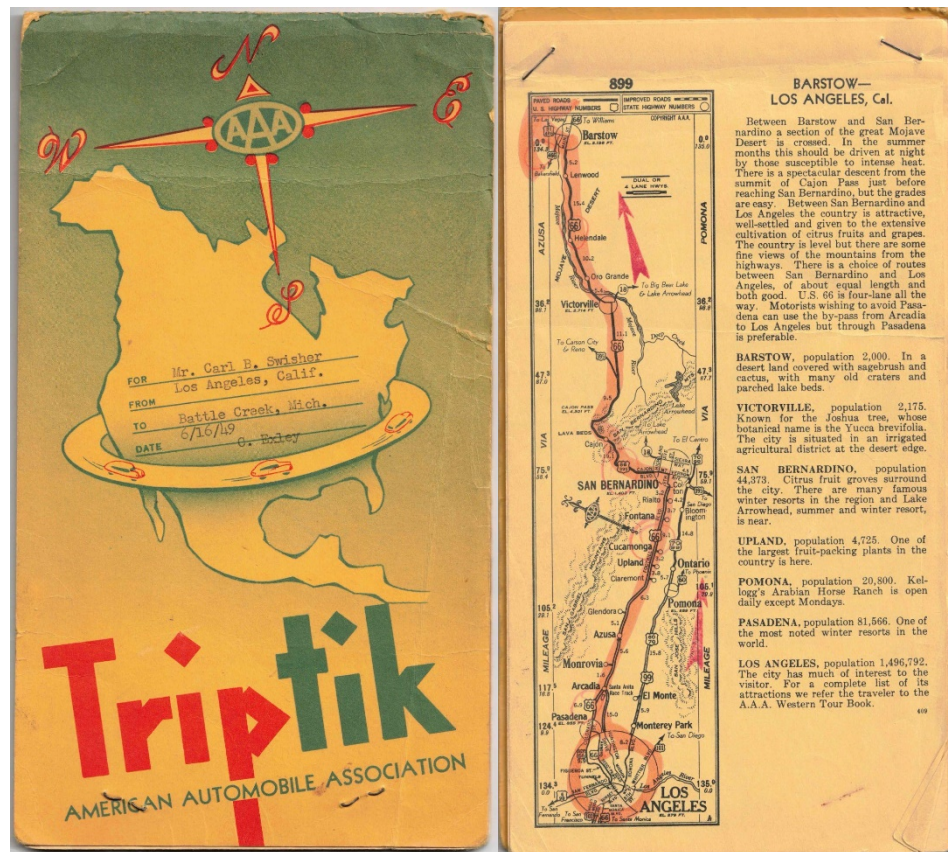
Figure 1. 1949 TripTik from Los Angeles to Battle Creek.