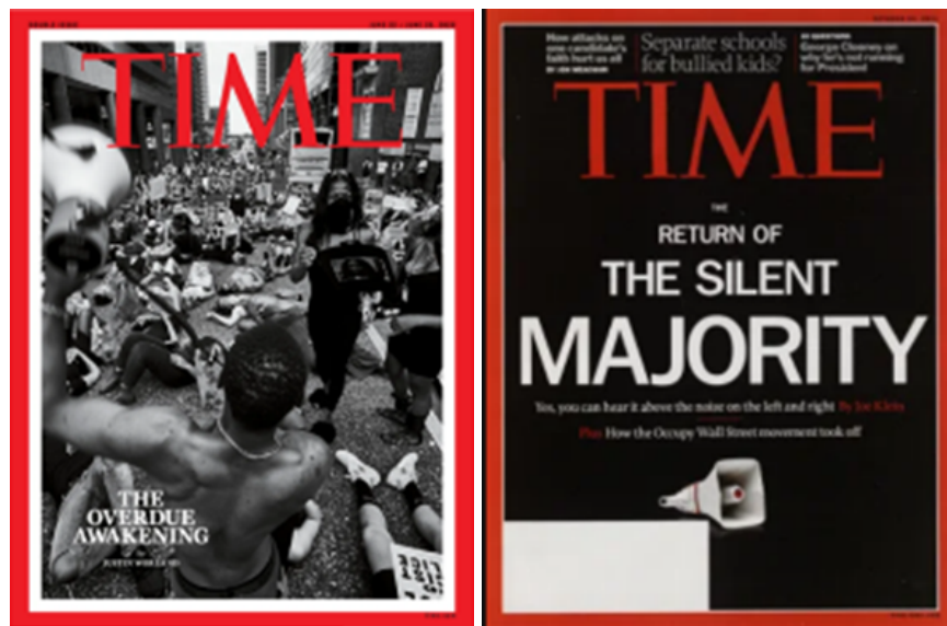
Figure 3. Covers conveying the protester’s ability to arrest attention (left: Felsenthal, 2020a; right: Stengel, 2011c).

Both magazines constructed the protester as engaged, active, and dignified. Time in particular semantically associated the protester with change, using words such as “revolution” (Stengel, 2011a), “change” (Stengel, 2011b), or “awakening” (Felsenthal, 2020a) in the cover titles. In 2011, the magazine crowned the protester as “The Person of the Year.” The protester’s ability to arrest attention was visually conveyed through power poses, such as raising arms or kneeling down, staring right into the camera voicing their grievances through protest posters. A few covers foregrounded individuals’ stern facial expressions and focused glances directly engaging the reader. The protester’s symbolic power was further evoked across several Time covers through the explicit and implicit use of megaphones (Figure 3). “The Overdue Awakening” (Felsenthal, 2020a) issue used a photograph of protesters holding megaphones, while another cover used only the image of a white megaphone against a black background anchored by the title “The Return of the Silent Majority” (Stengel, 2011c). In Der Spiegel , the symbolic power of protesters was conveyed by using the lyrics of the German anthem “Unity and Courage and Freedom” to title the issue (Buechner, 2014b).