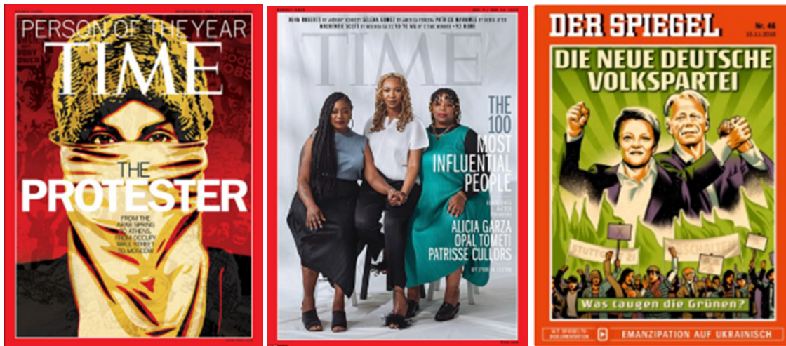
Figure 9. Female leadership covers (left: Stengel, 2011c; center: Felsenthal, 2020c; right: Mueller von Blumencron & Mascolo, 2010d).