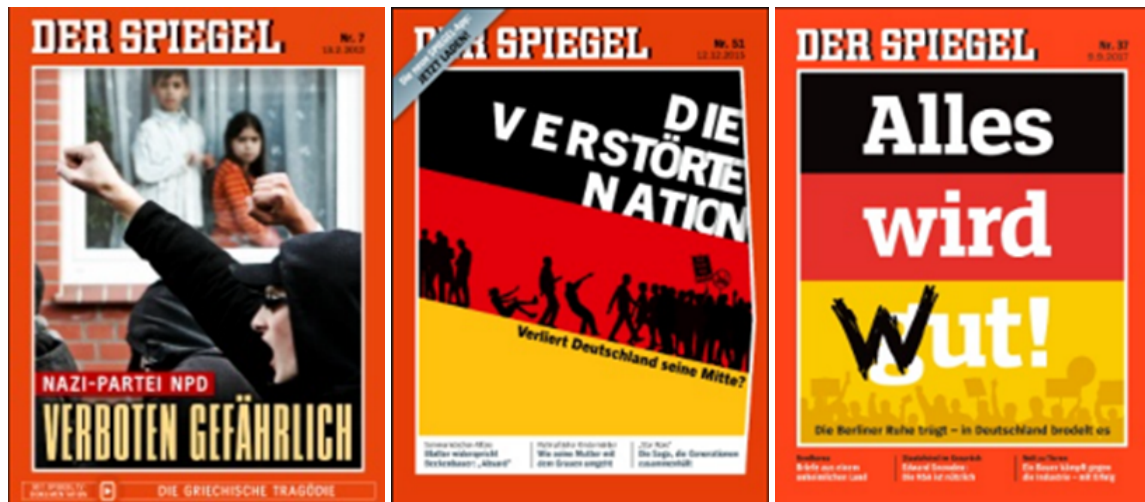
Figure 11. Polarization in Der Spiegel (left: Mascolo, 2012; center: Brinkbaeumer, 2015; right: Brinkbaeumer, 2017).

Other covers connected protest to polarization, marking it as potentially dangerous to the social fabric. The two covers dealt with the rise of the extreme right. Der Spiegel used a photograph of a street demonstration, with protesters' salute and black hoodies juxtaposed to the figures of two dark-haired children wearily watching them from behind the curtains of a household window (Figure 11). In an issue titled "Hate in America" (Gibbs, 2017), Time illustrated the surge in White supremacy with an illustration of man's silhouette raising the American flag in a patriotic gesture reminiscent of the Nazi salute. Both covers conveyed the idea of hate against the Other as an illegitimate driver of protest.