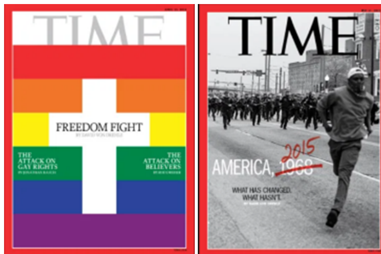
Figure 12. Polarization in Time (left: Gibbs, 2015a; right: Gibbs, 2015b).

Time also used polarization as a frame for specific causes, but not as a general commentary on the transformation of the realm of formal politics (Figure 12). This was the case of a cover depicting the LGBTQ movement as a fight between religious faith and human rights (Gibbs, 2015a). The historical movement for racial equality also evoked oppositions—such as protesters versus police, or White cop/Black cop—although such oppositions were positioned against the American dream of equality and justice rather than the danger of political polarization.