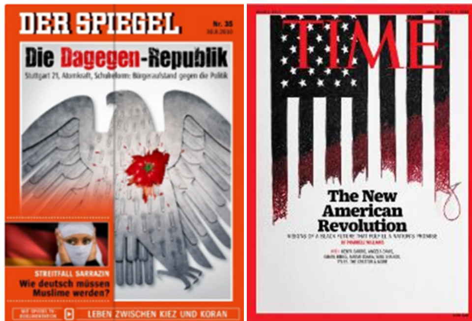
Figure 1. The use of national symbols (left: Mueller von Blumencron & Mascolo, 2010b; right: Felsenthal, 2020b).

For instance, Der Spiegel , remembered the fall of the Berlin Wall, linking the re-unification of the nation with citizen activism (Buechner, 2014b; Mueller von Blumencron & Mascolo, 2010c). In its coverage of the BLM movement (Figure 1), Time tinted the U.S. flag in black and presented it as a work in progress, still being woven by an invisible hand and slowly regaining its original colors (Felsenthal, 2020b). Through its association with the national flag, the BLM movement was articulated as an atonement for lingering past injustice, marking the latter as incompatible with the very idea(l) of the U.S. nation.