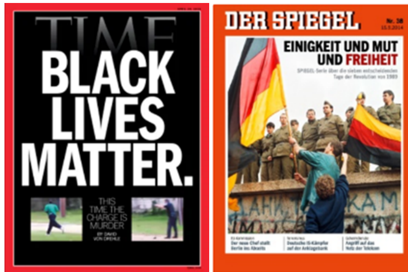
Figure 4. Confrontation covers (left: Gibbs, 2015a; right: Buechner, 2014b).

The confrontation angle was also suggested in one Der Spiegel cover about the fall of the Berlin Wall (Figure 4), depicting peaceful protesters waving flags against a wall of soldiers (Buechner, 2014b).