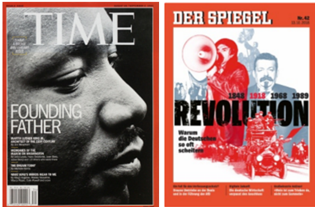
Figure 7. Covers referencing individual leadership (left: Stengel, 2013b; Brinkbaeumer, 2018).

other images evoking past protests. Neither was named, suggesting the magazine expected them to be immediately recognized by German audiences (Figure 7).