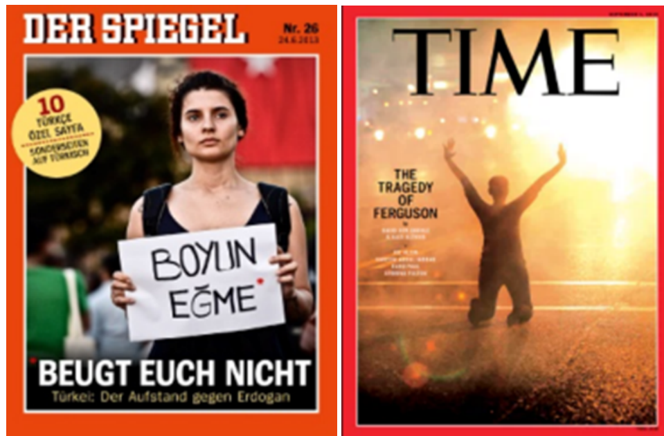
Figure 6. The individual protester covers (left: Buechner, 2013; right: Gibbs, 2014).

The image of the protest leader was, on the other hand, a preferred approach. With few exceptions, leaders were young and casual. Furthermore, almost all were removed from actual protest situations and photographed either in a studio or in a choreographed setting. In some cases, leadership was explicitly referred to through either formulations such as “the founding father” (Stengel, 2013b, in reference to Martin Luther King) or “the silence breakers” (Felsenthal, 2017, in reference to #MeToo mobilizers); or by featuring these individuals in special issues dedicated to “the most influential people” (Felsenthal, 2018c) or “Person of the Year” (Felsenthal, 2019b). In other cases, leadership was not explicitly addressed. Der Spiegel dedicated one issue to historicizing “failed” revolutions from 1848 onward, cropping the images of well-known German activist Rudi Dutschke and of former politician/chancellor Friedrich Ebert (a pivotal figure of the German revolution of 1918–1919) alongside