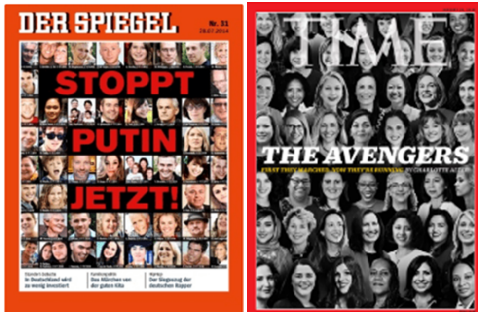
Figure 5. Collages signaling the idea of power in numbers (left: Buechner, 2014a; right: Felsenthal, 2018a).

Whenever stylized representations of protest were preferred to photographs, the symbolic power of bodies on the streets and of the disruption of everyday spaces was erased. The protesting mass as a signifier of power in numbers can thus be seen as a visual counterpart of one of the protest paradigm devices, namely the reliance on statistics and generalizations to frame protest (Dardis, 2006).