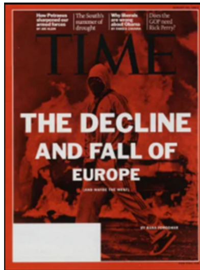
Figure 10. Violence on covers (Stengel, 2011b).

Other covers connected protest to polarization, marking it as potentially dangerous to the social fabric. The two covers dealt with the rise of the extreme right. Der Spiegel used a photograph of a street demonstration, with protesters' salute and black hoodies juxtaposed to the figures of two dark-haired children wearily watching them from behind the curtains of a household window (Figure 11). In an issue titled "Hate in America" (Gibbs, 2017), Time illustrated the surge in White supremacy with an illustration of man's silhouette raising the American flag in a patriotic gesture reminiscent of the Nazi salute. Both covers conveyed the idea of hate against the Other as an illegitimate driver of protest.