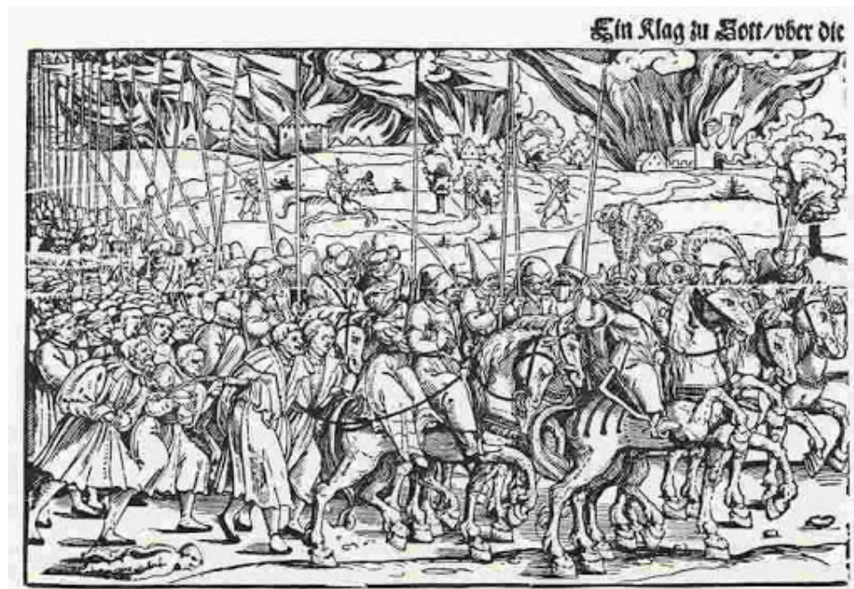
Figure 2. Erhard Schön (1530), A Lament to God about the many and horrible frenzied deeds committed by bloodthirsty Turks and request for merciful help.