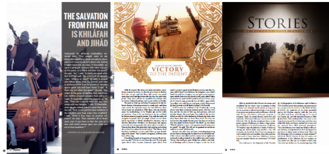
Figure 1. IS’s strategic self-Othering practices (Dabiq, 2015a, p. 44; Rumiyah, 2016a, p. 26; Rumiyah, 2016c, p. 28).

conflict” (p. 1), throughout this period audiences were repeatedly presented with images exhibiting vast convoys of vehicles propelling through arid desert landscapes and pouring into towns and cities across the region. As can be seen in Figure 1, the group deployed slick visuals depicting near-identical rows of dusty, white Toyota Hilux pickup trucks either arranged in tight formation ( Dabiq , 2015a, p. 44) or pictured sweeping through pristine desert landscapes ( Rumiyah , 2016a, p. 26). 1