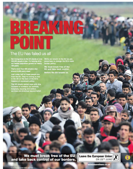
Figure 3. Leave.EU (2016) Islamist extremism is a real threat to our way of life and UKIP (2016) Breaking point.

Further dimensions to these strategic self-Othering practices are the graphic depictions of the IS's brutality and uncivilized violence (see Friis, 2015). Thus, appearing alongside photographs depicting the group as a large, aggressive, and rapidly expansive force has been a series of images portraying its fighters willfully indulging in archaic and barbaric forms of violence (see Figure 4). In al-Naji's (2004) words, the core objective behind such a strategy has been to kill hostages and enemies "in [such] a terrifying manner" so as to "send fear into the hearts of the enemy and his supporters" (p. 33).