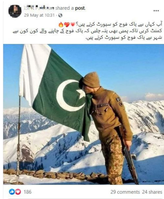
Figure 1. Metaphors of swearing an oath to the nation (Source: Voice of Pakistan, 2020).