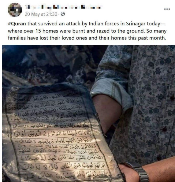
Figure 8. Using sacred texts as symbols (Stop Killing Muslims in Kashmir, 2020).

Language and keywords analysis revealed an overall tendency for the social media users to construct these strategies through classifications between “us” and “others.” Specifically important are “Us” (Pakistanis/Kashmiris) and nonimportant “Others” (Indians), versus good “Us” (Pakistanis) and evil “Others” (Indians). Strategies of historicizing the nation have inundated discourse by theorizing a past nation built on memories of common suffering and sacrifice to reinforce discursive construction of a common Pakistani identity that includes Kashmiris. Last, the surprising lack of counterdiscourse, that is, pro-India sentiments, in our Facebook data suggests that it is so commonplace to construct a nation on anti-Indianism that this has become a naturalized polarization for citizens.