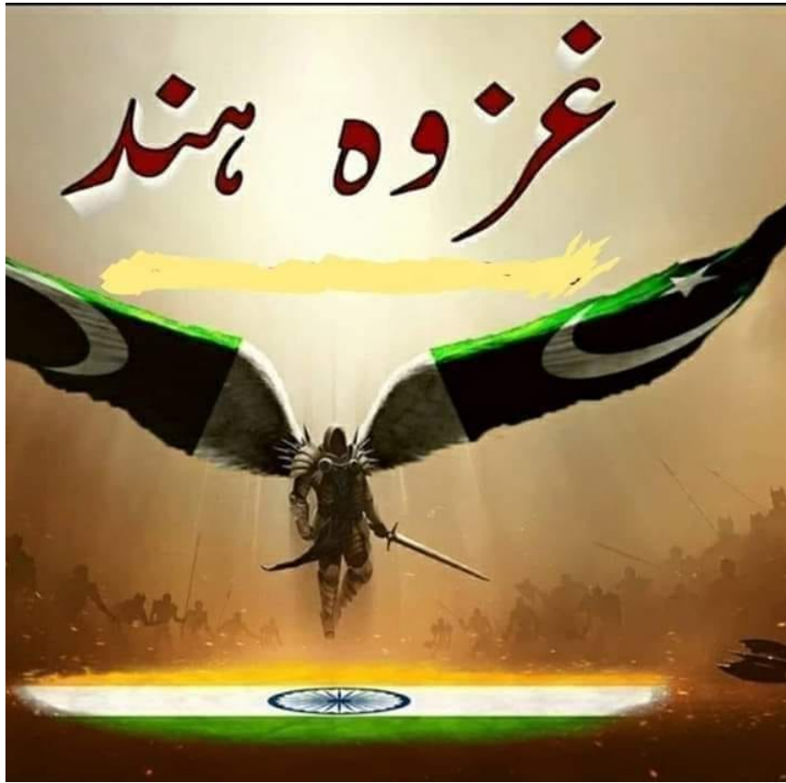
Figure 3. Symbolizing radical imagery.