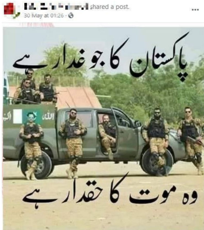
Figure 4. War rhetoric for greater emotive power (Source: Voice of Pakistan, 2020).

Using elements identified in the tropes or rhetorical devices, text producers have used a combination of images, videos, and texts to draw or build on existing stories that arouse fondness of the military. These gendered constructions of nationhood are often negotiated by supporting the troops or supporting our brothers, fathers, and sons. This offers an interesting insight into the language by citizens, where the nation is always female—mother, motherland, soil—and backing the military is always masculine, akin to supporting brothers, fathers, and sons. These groups have also taken the liberty of romanticizing army personnel as national heroes and saviors to attain their collective hopes and aspirations.