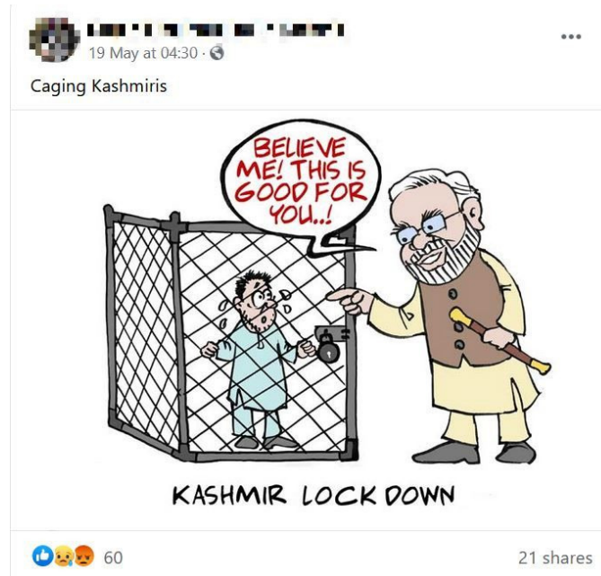
Figure 6. Depiction of lockdown and "caged" Kashmiris at the hand of the Indian PM (Source: Stop Killing Muslims in Kashmir, 2020).