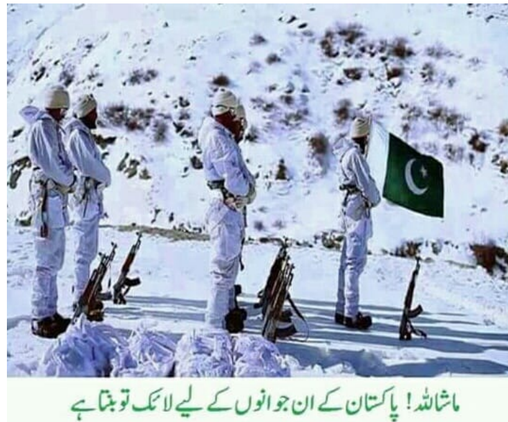
Figure 2. Pakistani army praying with a hoisted flag and upright arms (Source: Voice of Pakistan, 2020).